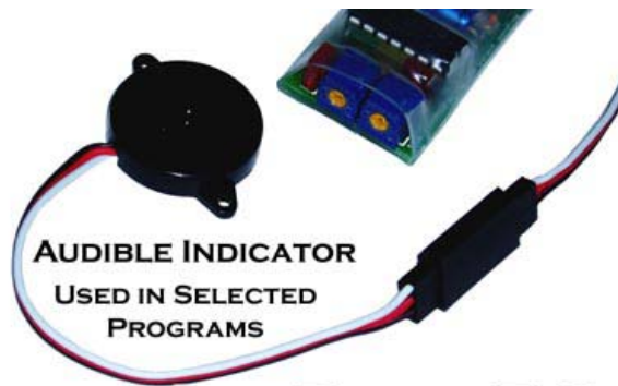
PUNKRC PROGRAMMABLE COMPUTER